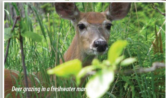
Deer grazing in a freshwater marsh