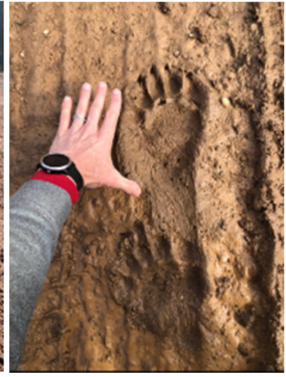
Tracks April 29, 2021