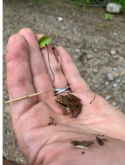
Wood Frog August 12, 2021