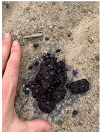
Scat August 12, 2021