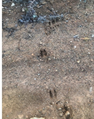
Tracks May 5, 2021