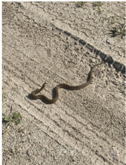
Maritime Garter Snake August 26, 2021