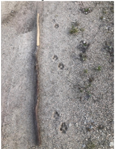
Tracks May 5, 2021