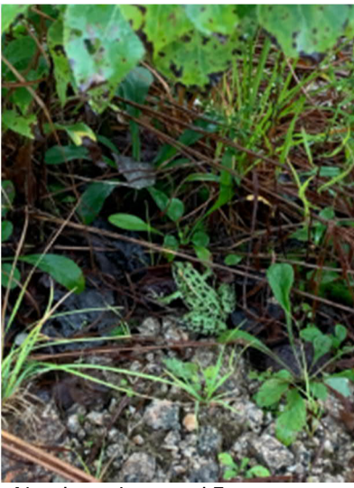
Northern Leopard Frog August 24, 2021