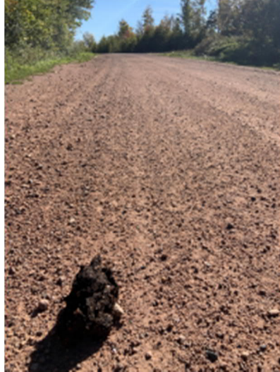
Scat on Hingley Rd. October 6, 2021