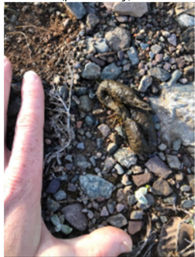
Scat May 14, 2021