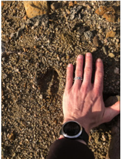
Tracks May 5, 2021