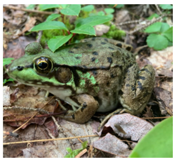
Green Frog September 13, 2021