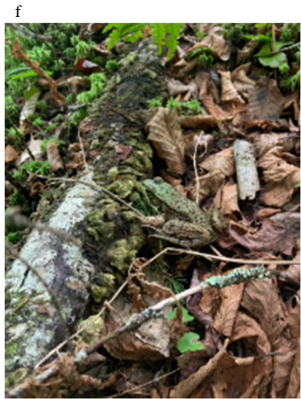
Mink Frog September 13, 2021