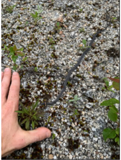
Northern Ringneck Snake June 29