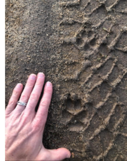
Tracks May 10, 2021