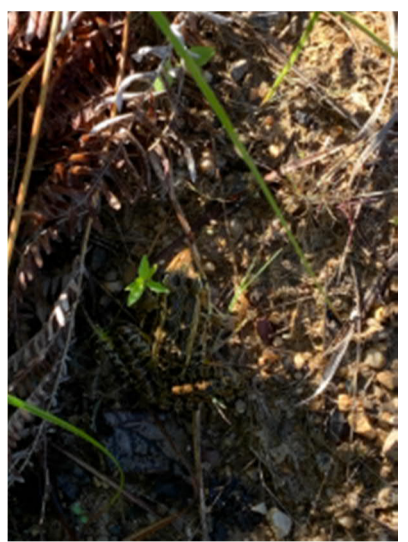
Pickerel Frog June 24, 2021