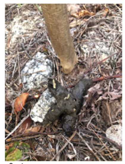
Scat May 11, 2021