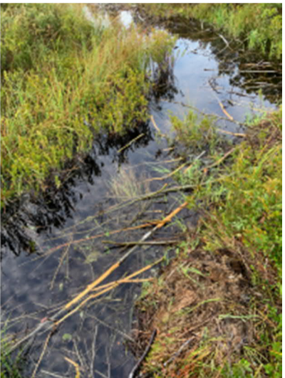
Chewed sticks September 1, 2021