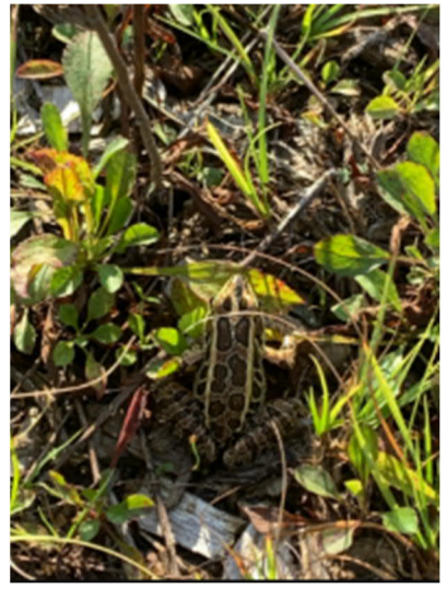
Pickerel Frog August 26, 2021