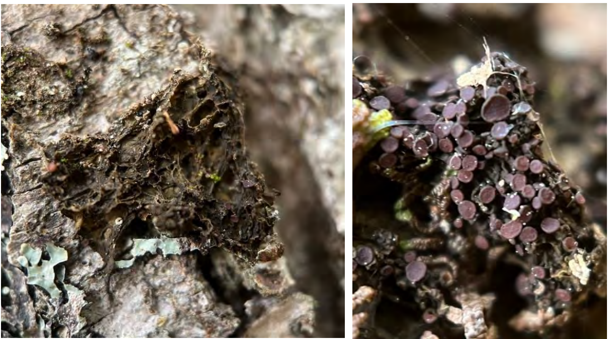
Photo 5.7 Crumpled Bat's Wing Lichen ( Collema leptaleum ), a lichen SoCC detected on within the Study Area. Left: Whole thallus on bark. Right: Closeup showing apothecia.

Area, growing on the trunk of a mature red maple. Known locations within the Study Area are depicted on Figure 5-1 through Figure 5-4.