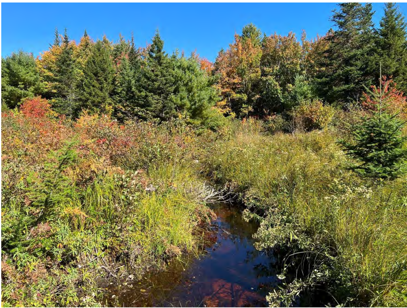
Photo 4.4 Example of Fen Wetland observed within Study Area, showing slow moving surface water in channel and thick layer of ericaceous shrubs.