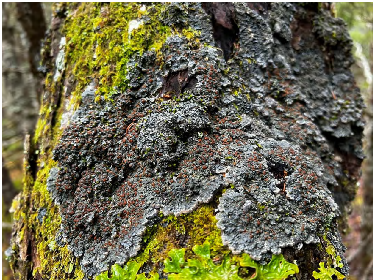
Photo 5.4 Blue felt lichen ( Pectenia plumbea ) specimen detected within Wetland

CBCL ecologists detected this species on three trees in two separate locations within the Study Area during the 2022 field surveys. These locations are depicted on Figure 5-1 through Figure 5-4.