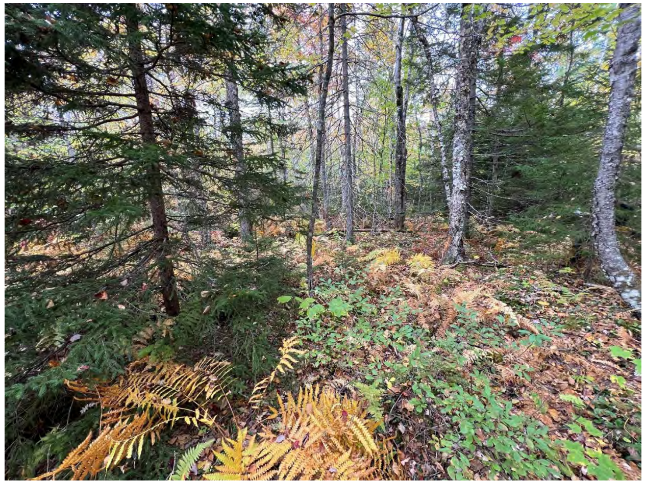
Photo 5.19 Example of MW4 Balsam fir - Red maple / Wood sorrel - Goldthread VT.