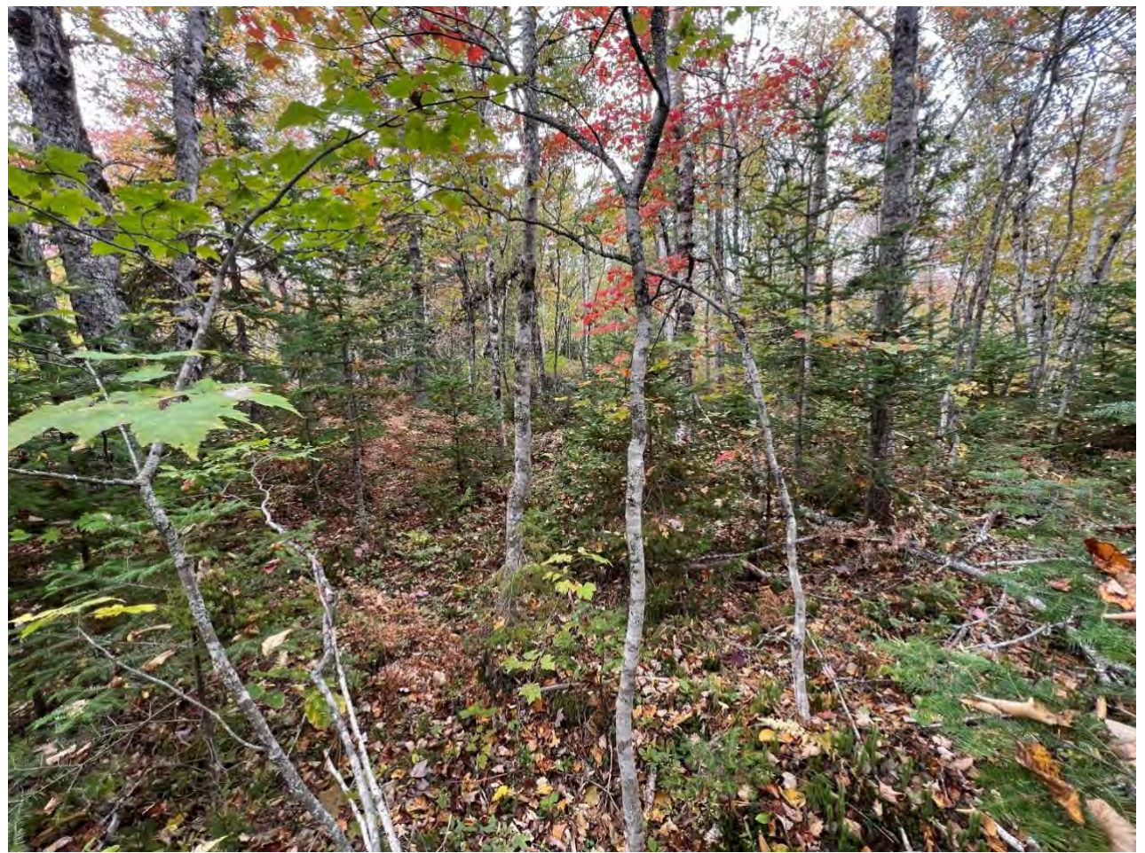
Photo 5.18 Example of MW2 Red Spruce - Red Maple - White Birch / Goldthread VT.