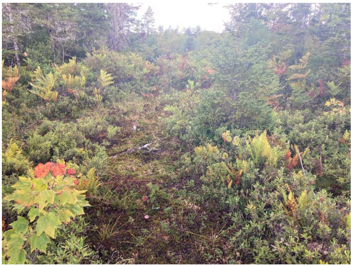
Photo 4.3 Example of Bog Wetland observed within Bear Lake II Study Area, showing sparse tree cover, abundant ericaceous shrubs, and thick carpet of peatmosses ( Sphagnum spp.).

Of the 81 wetlands assessed at Bear Lake, only one (<1%) had a strongly dominant bog component; though bog conditions were present in at least two other wetlands in smaller proportions. Details of the wetland vegetation, hydric soils, and hydrology of the wetland is provided in Appendix C.