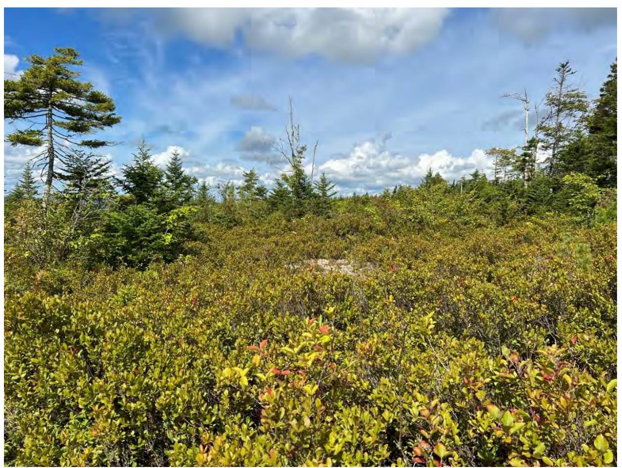
Photo 5.26 Typical Vegetation of Black Huckleberry Heath (BENS) Shrub Barren VT.

typically shallow but may occasionally be deep enough to support small trees, mainly Red Maple, Balsam Fir, Black Spruce, White Spruce and Tamarack. Bunchberry and Wild Lily-ofthe-Valley frequently occur, as does Starflower. Bracken Fern is frequently present in sheltered microsites. On low elevation sites, Grey Reindeer Lichen and Reindeer Lichen are the most common lichen species. This VT rarely reaches an average vegetation height of more than 1.5 m.