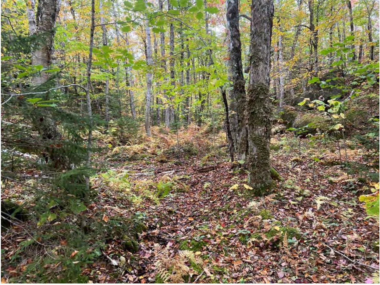
Photo 5.17 Example of MW2 Red Spruce - Red Maple - White Birch / Goldthread VT.