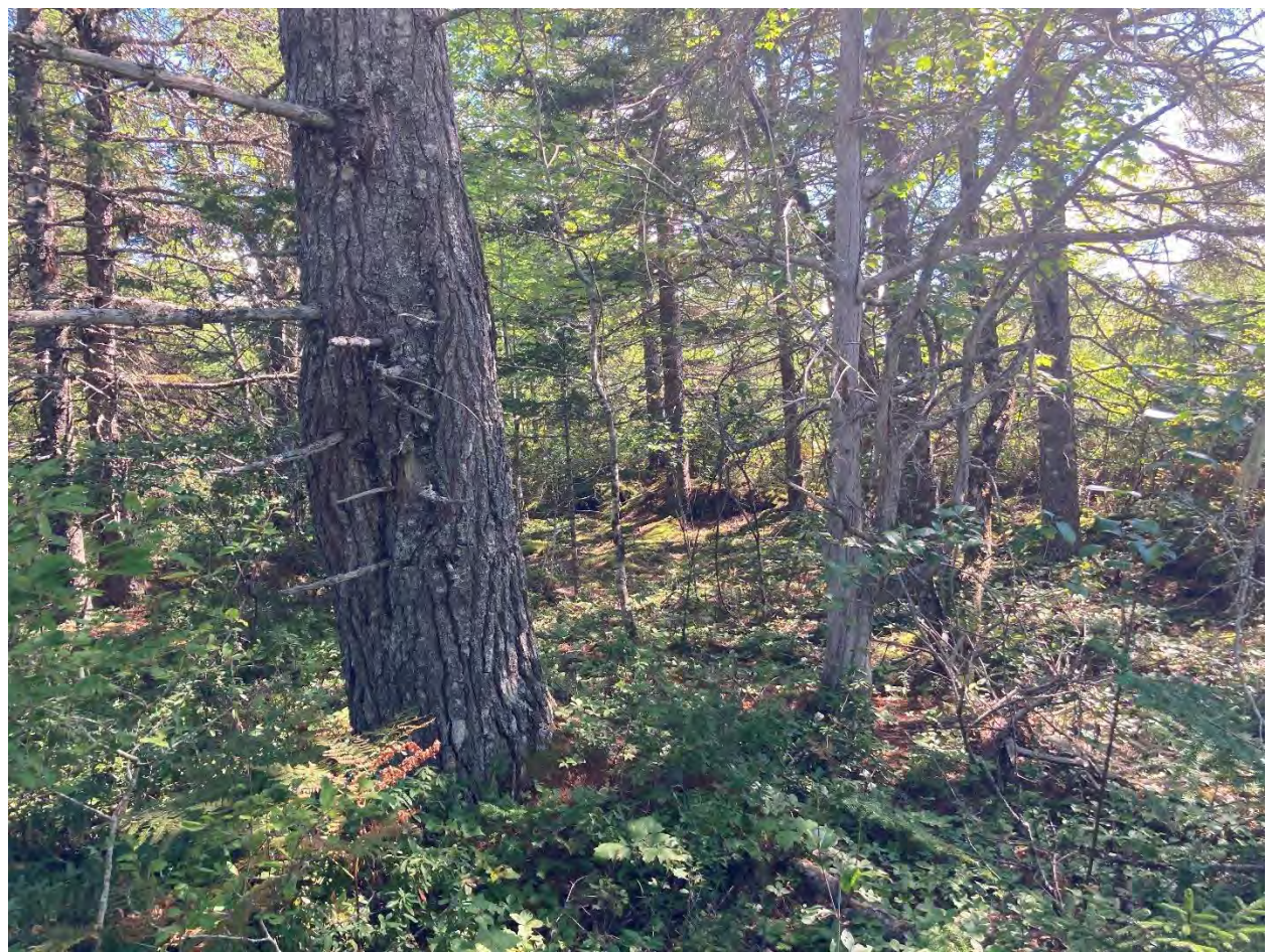
Photo 5.20 Example of SH4 - Red spruce - White pine / Lambkill / Bracken VT.