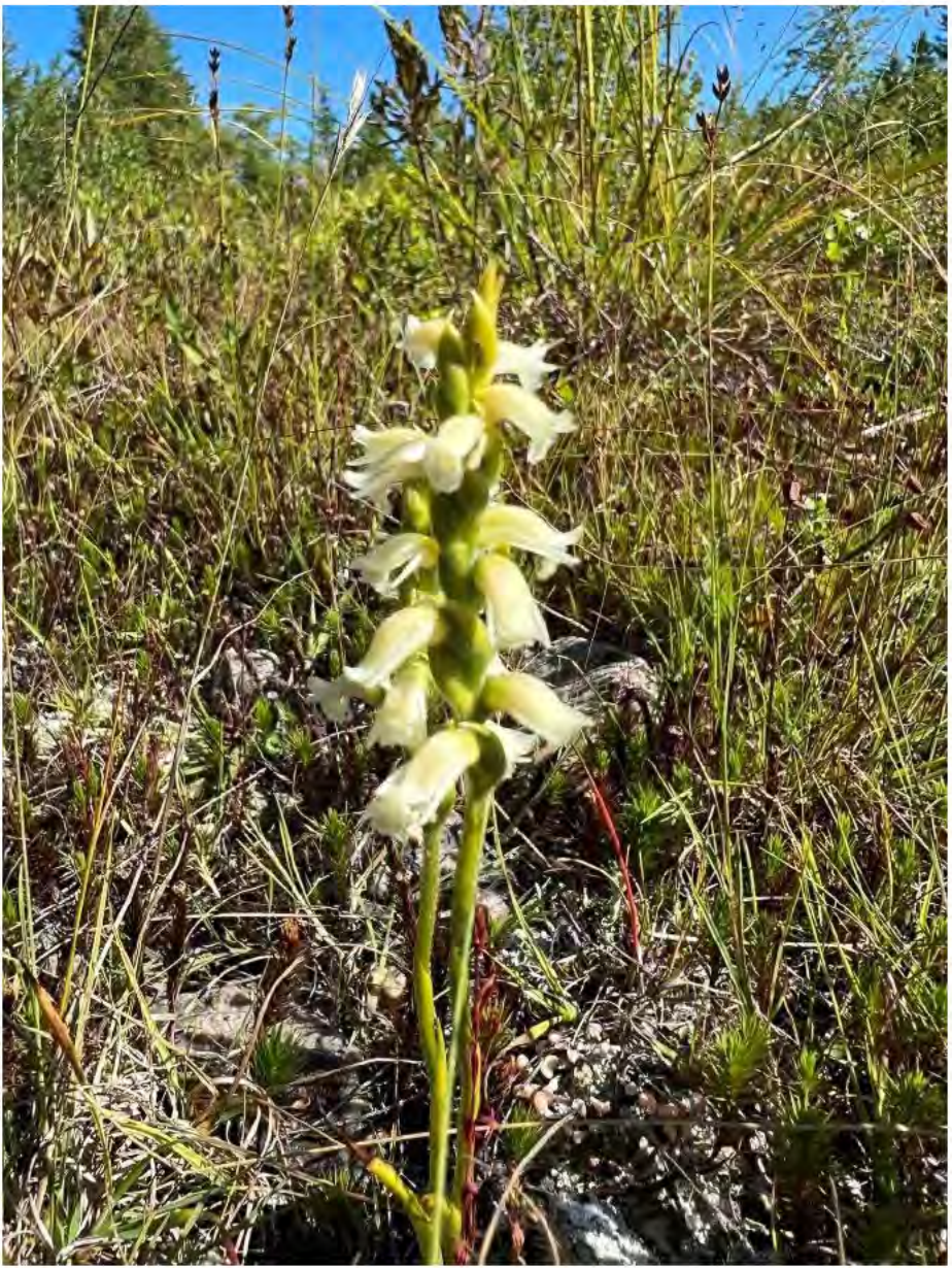
Photo 5.3 Yellow Ladies'-tresses ( Spiranthes ochroleuca ), an orchid SoCC detected within the Study Area.

Yellow Ladies'-tresses ( Spiranthes ochroleuca ) is a small species of orchid with noticeably fragrant yellowish or creamy-yellow flowers. It flowers from September to October. It occurs only in very dry sand barrens, roadsides, and fields, in the western half of NS, northwest to Hants County (Munro et al., 2014).