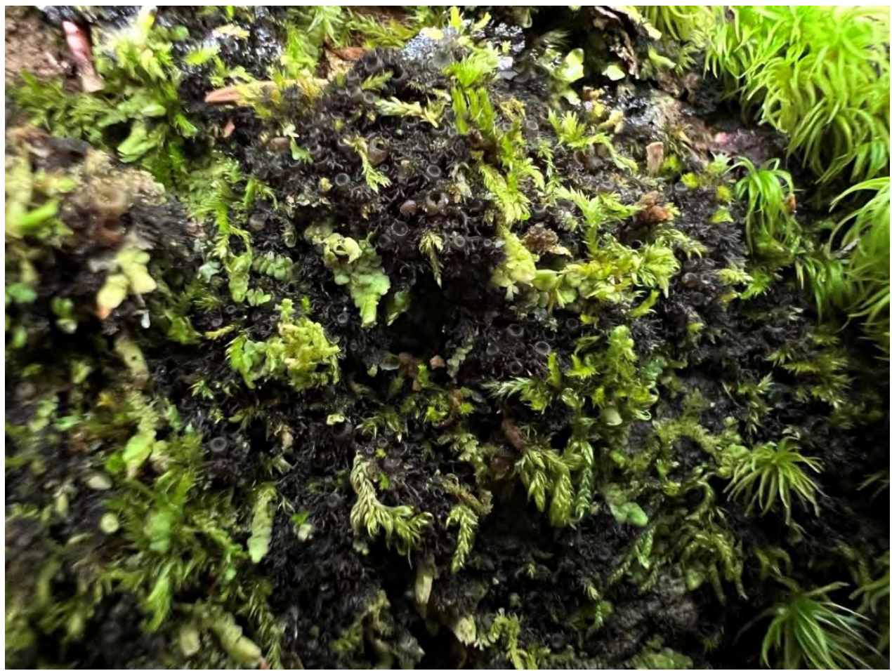
Photo 5.11 Birdnest Jellyskin Lichen ( Scytinium tenuissimum ) a lichen SoCC detected within the Study Area.