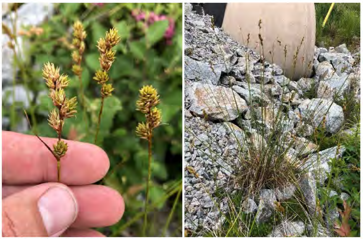
Photo 5.1 Lesser Brown Sedge ( Carex adusta ) inflorescence (left) and whole plant (right). Photos are of representative material from another location.

Lesser Brown Sedge ( Carex adusta ) is a tall and coarse sedge species, with culms that may reach 80 cm. It has a compact inflorescence that is erect and less than 4 cm long. It has widely elliptic perigynia that are 1.5 mm wide and 4 mm long. This species flowers and fruits from June to September, and within Nova Scotia is primarily found in dry, open forest or recent clearings on acidic, gravelly soils, most frequently after a fire. Within the Province, distribution of this species is scattered and uncommon, from Kejimkujik National Park to Cumberland counties and northern Cape Breton (Munro et al., 2014). The AC CDC ranks Lesser Brown Sedge as S3S4 in Nova Scotia. The location of this species within the Study Area is depicted on Figure 5-1. The AC CDC ranks Lesser Brown Sedge as S3S4 in Nova Scotia at a single location within the Study Area (Figure 5-1).