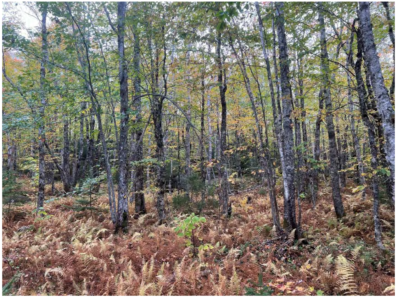
Photo 5.15 Example of IH7 Red maple / Hay-scented fern - Wood sorrel VT.

The IH7 Red maple / Hay-scented Fern - Wood Sorrel VT is associated with fresh to moist, nutrient medium to rich soils of variable texture. It is dominated by red maple and lesser amounts of several shade-tolerant trees, such as Sugar Maple, Yellow Birch and/or Red Spruce. The shrub layer is moderately developed and includes regenerating trees (including Balsam Fir), Canada Fly-Honeysuckle ( Lonicera canadensis ) and Striped Maple. It also supports a diverse herb layer, which is indicative of mesic Nova Scotia hardwood forests. Herbaceous vegetation is dominated by ferns, most notably Hay-scented Fern which can be an aggressive competitor in open, disturbed sites. Other common species include New York Fern ( Parathelypteris noveboracensis ), Evergreen Wood Fern ( Dryopteris intermedia ), Rose Twisted Stalk ( Streptopus lanceolatus ), Indian Cucumber Root ( Medeola virginiana ), Wood Aster ( Oclemena acuminata ), Wood Sorrel ( Oxalis montana ), Bristly and Shining Club-moss ( Spinulum annotinum and Huperzia lucidula ), and various violet ( Viola ) species. The bryophyte layer is poorly developed. This VT occurs throughout NS but is particularly common on upper slope positions within the Nova Scotia Uplands ecoregion.