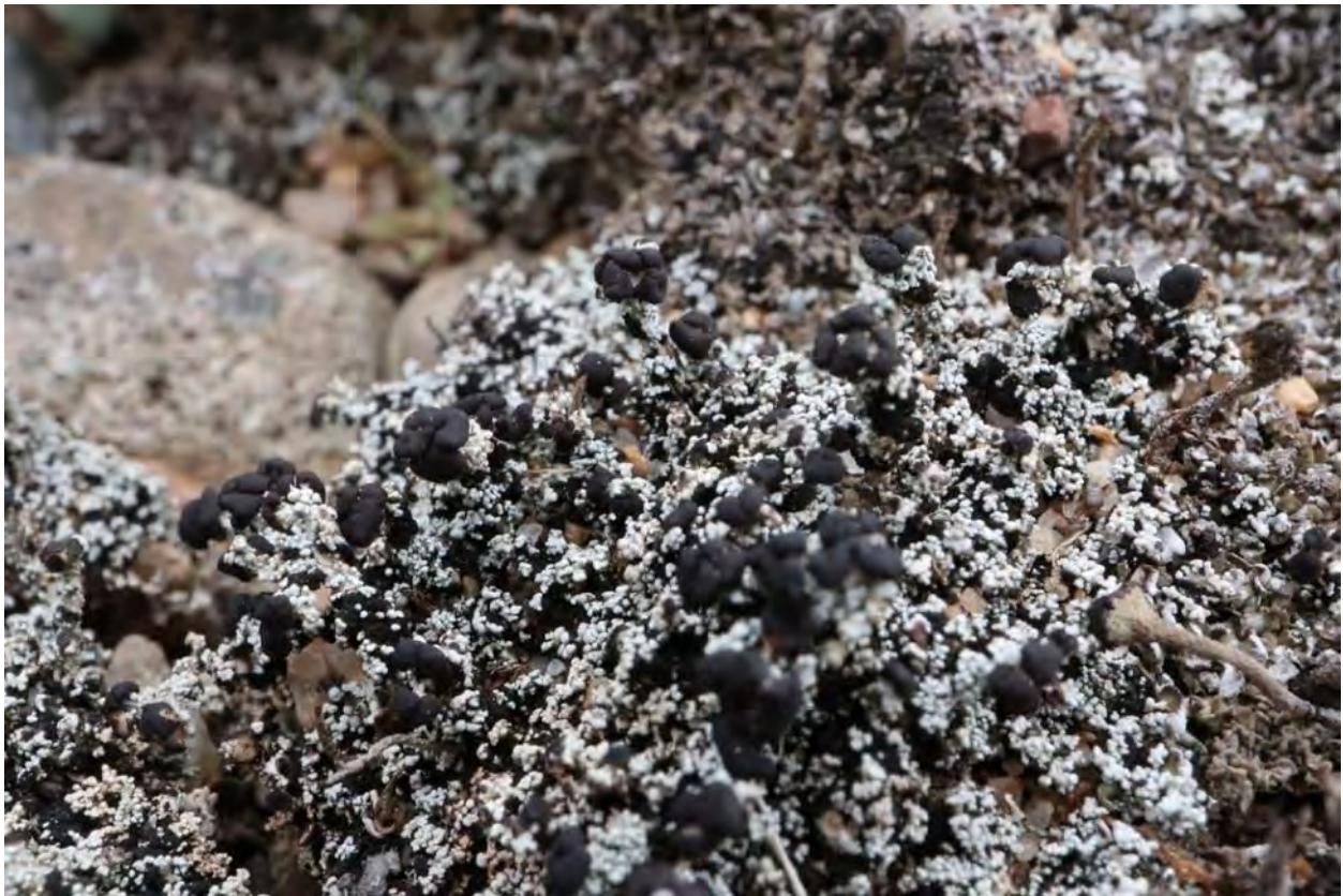
Photo 5.12 Granular Soil Foam Lichen ( Stereocaulon condensatum ), a lichen SoCC detected within the Study Area.