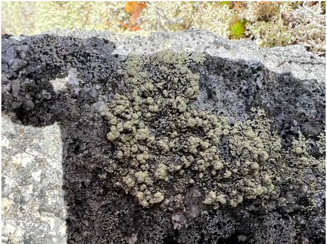
Photo 5.6 Specimen of Finger Ring Lichen ( Arctoparmelia incurva ), a lichen SoCC occurring on a granite boulder within the Study Area.

Finger Ring Lichen is ranked as S3S4 ('Vulnerable' to 'Apparently Secure' ) in Nova Scotia by the AC CDC. Finger Ring Lichen was found a single location within the Study Area, depicted on Figure 5-1 through Figure 5-4.