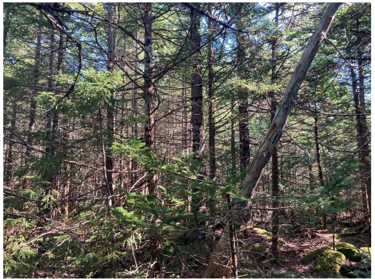
Photo 5.22 Example of SH5 Red Spruce - Balsam Fir / Schreber's Moss VT Observed within Study Area.