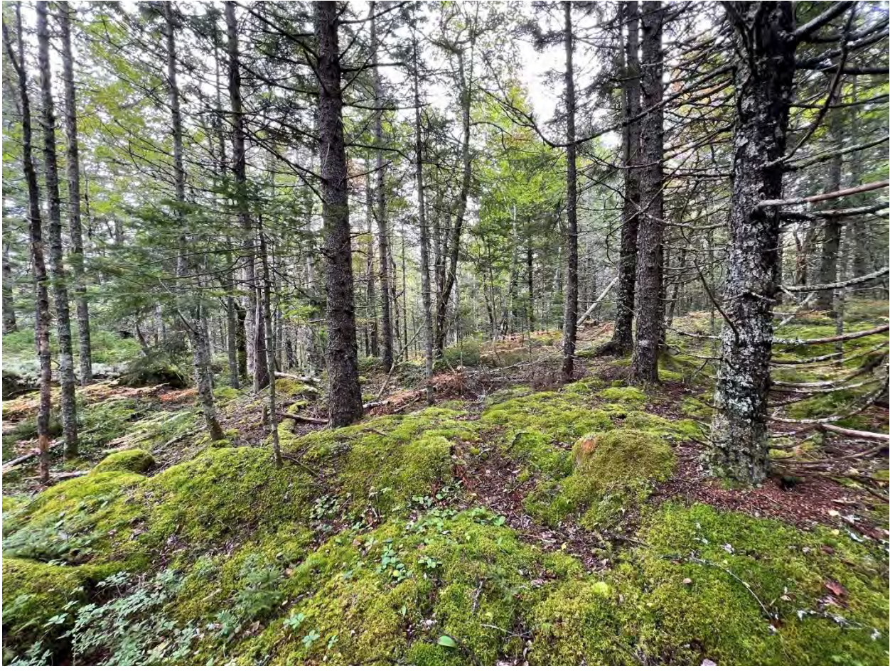
Photo 5.21 Example of SH5 Red Spruce - Balsam Fir / Schreber's Moss VT.