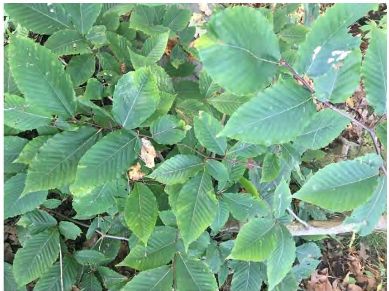
Photo 5.2 View of distinctive leaves of American Beech ( Fagus grandifolia ), a widespread but declining tree SoCC which is relatively common within the Study Area.

leaves emerge (Munro et al., 2014). American Beech prefers dry-mesic to mesic soil moisture regimes and is found growing in deciduous or mixed evergreen-deciduous forests (Haines, 2011). Currently, American Beech in Nova Scotia rarely reach maturity due to Beech Canker, caused by the fungus Nectria coccinea which is spread by the introduced scale insect Cryptococcus fagisuga . Healthy, disease-free stands are limited but can occur in Kentville, along the Cornwallis River. In more recent years, American Beech populations in NS have also been threatened by the recent introduction of another insect, the Beech Leaf-Mining Weevil, Orchestes fagi , a European species which was discovered infesting American Beech in Nova Scotia in 2012, though it is suspected to have become established 5-10 years prior (Sweeney et al., 2020). The combined effects of these species have led to American Beech being reclassified as an S3S4 species by the AC CDC in 2022.