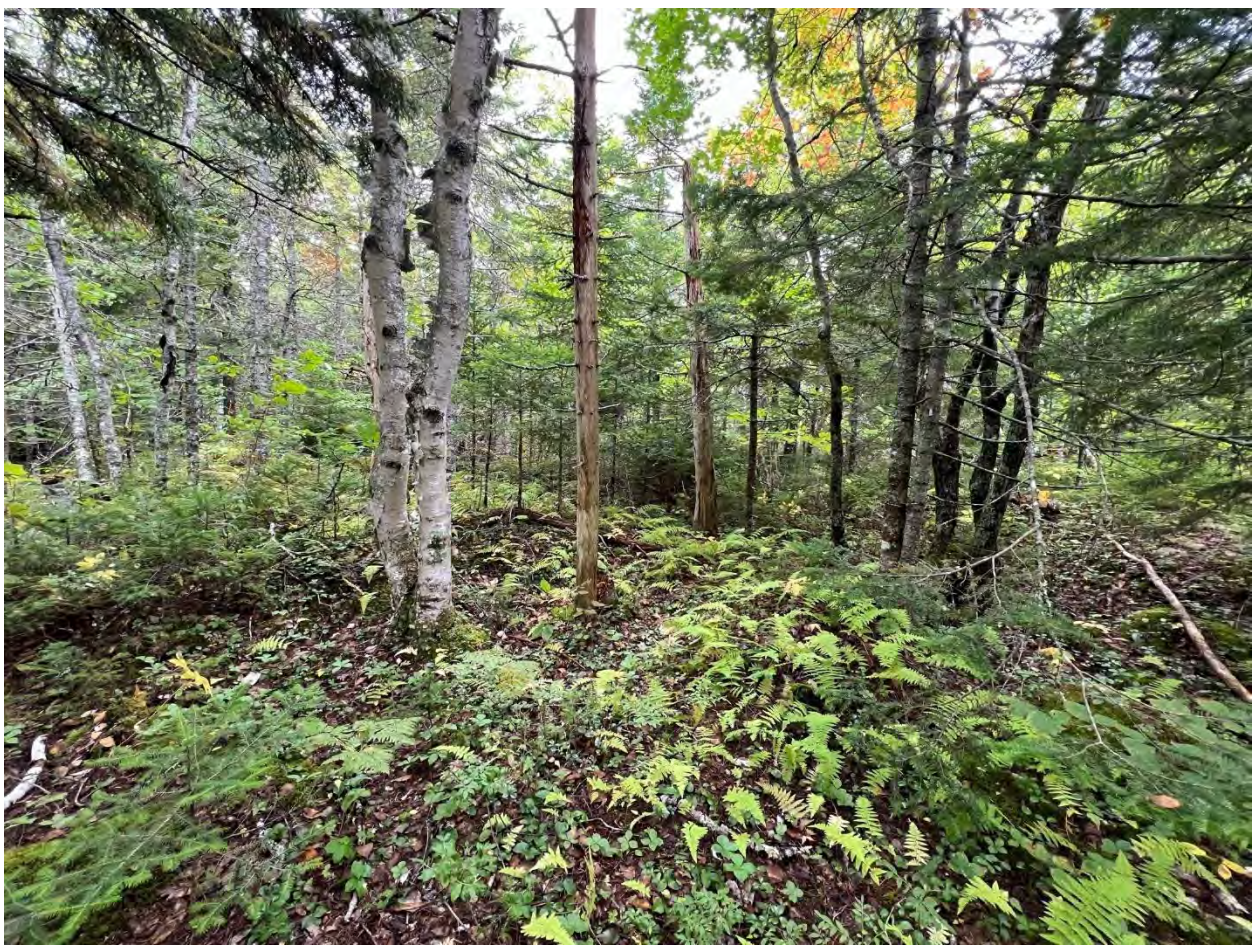
Photo 5.14 Example of IH6 – White Birch - Red Maple / Sarsaparilla – Bracken VT.

The White Birch – Red Maple / Sarsaparilla – Bracken VT is typically associated with dry to moist sites, with a variable nutrient content. In this VT, White Birch and Red Maple are the most common overstory trees, with Occasional Balsam Fir, Red and White Spruce ( Picea glauca ), White Pine and Yellow Birch. The typically well-developed shrub layer often comprises Wild Raisin, Serviceberry ( Amelanchier spp.), Sheep Laurel, Blueberry ( Vaccinium spp.), Striped Maple and various species of regenerating trees. Herbaceous layer components commonly include Bracken Fern, woodferns ( Dryopteris spp.), Sarsaparilla, Starflower, and Bunchberry, and minor amounts of bryophytes such as Schreber's moss and Hypnum species.