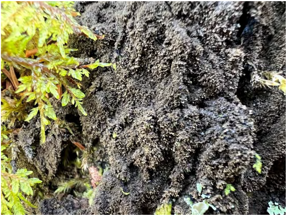
Photo 5.8 Corrugated Shingles Lichen ( Fuscopannaria ahlneri ), a lichen SoCC detected within the Study Area.