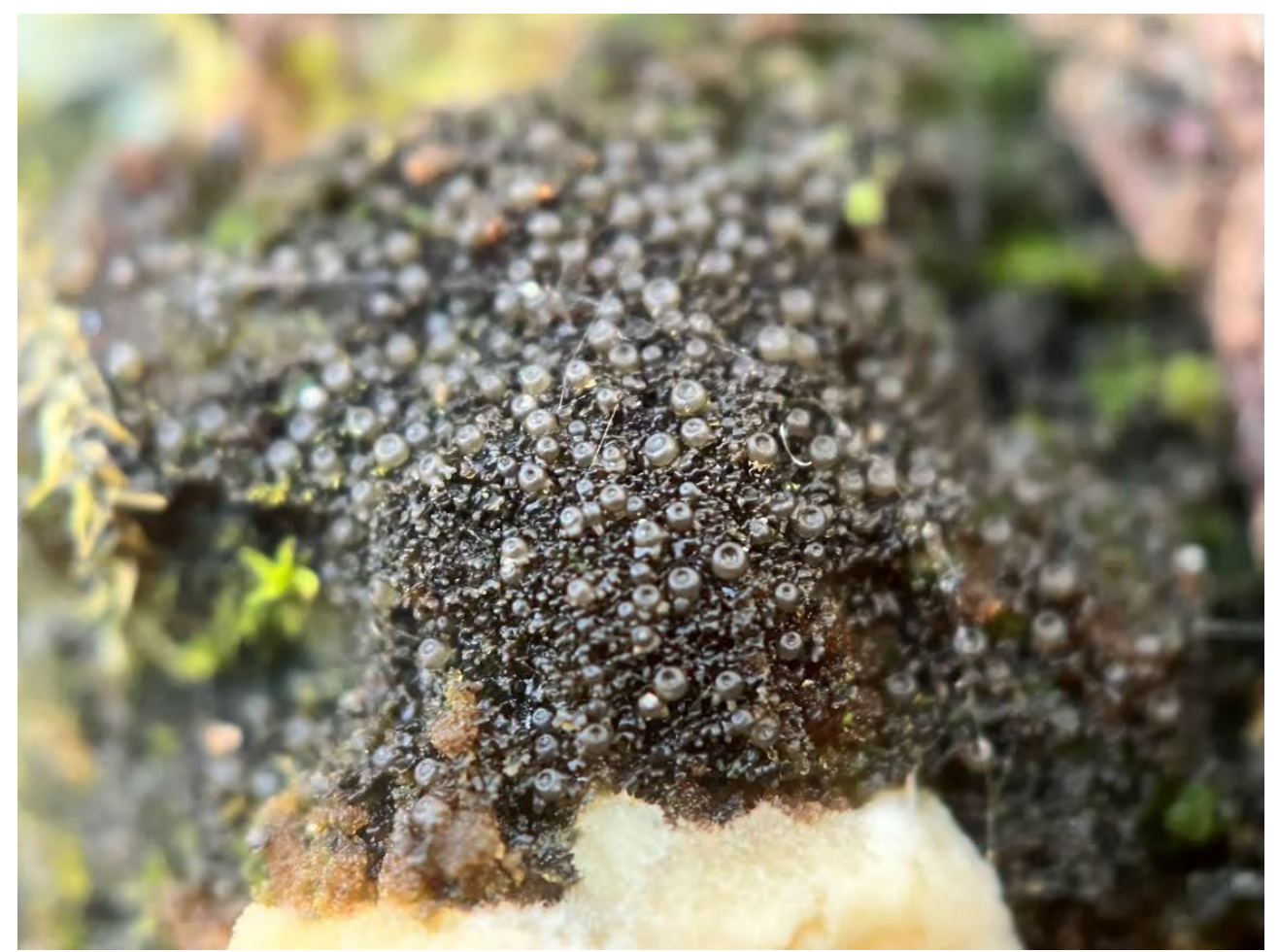
Photo 5.10 Appressed Jellyskin Lichen ( Scytinium subtile ), a lichen SoCC detected within the Study Area.