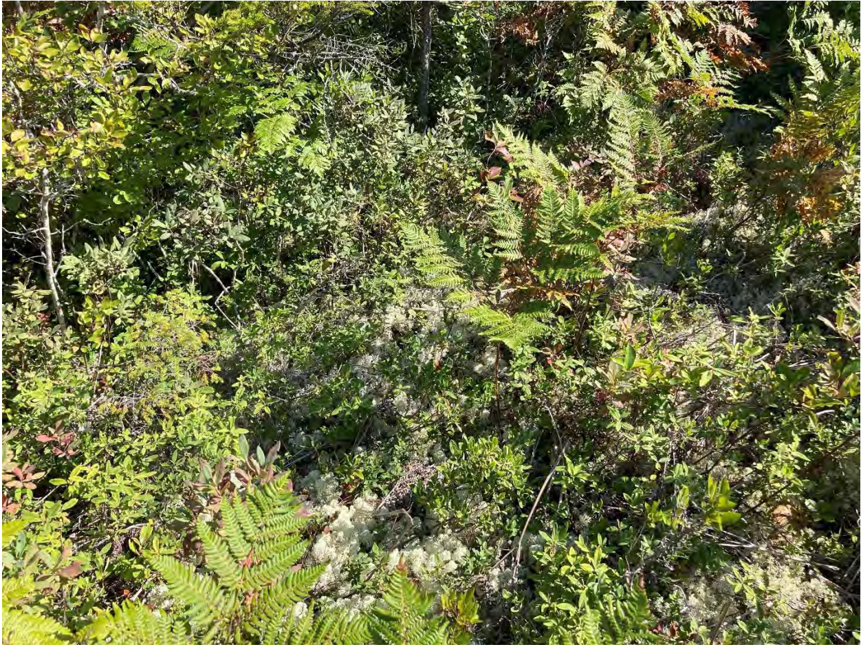
Photo 5.25 Typical Vegetation of Sheep Laurel Inland Heath (BENS) Shrub Barren VT.

This vegetation type is a type of shrub barren which is dominated by Sheep Laurel on inland barrens occurring over surficial deposits of glacial till or sand. Indicator species include Sheep Laurel, Bracken Fern, Eastern Teaberry, and Inkberry ( Ilex glabra ), Lesser amounts of Rhodora and Wild Raisin frequently occur. The dwarf shrubs Eastern Teaberry and Lowbush Blueberry are also frequently present, as are the taller Bristly Dewberry ( Rubus hispidus ) and Black Chokeberry ( Aronia melanocarpa ). Black Spruce and Eastern White Pine are the most common tree species encountered within the association, (though not likely to be tree-sized). Bracken Fern is frequent and abundant. Grey Reindeer Lichen ( Cladonia rangiferina ) and Reindeer Lichen ( Cladonia arbuscula ssp. squarrosa ) both commonly occur, but do not generally provide more than 5% cover (Porter et al., 2020).