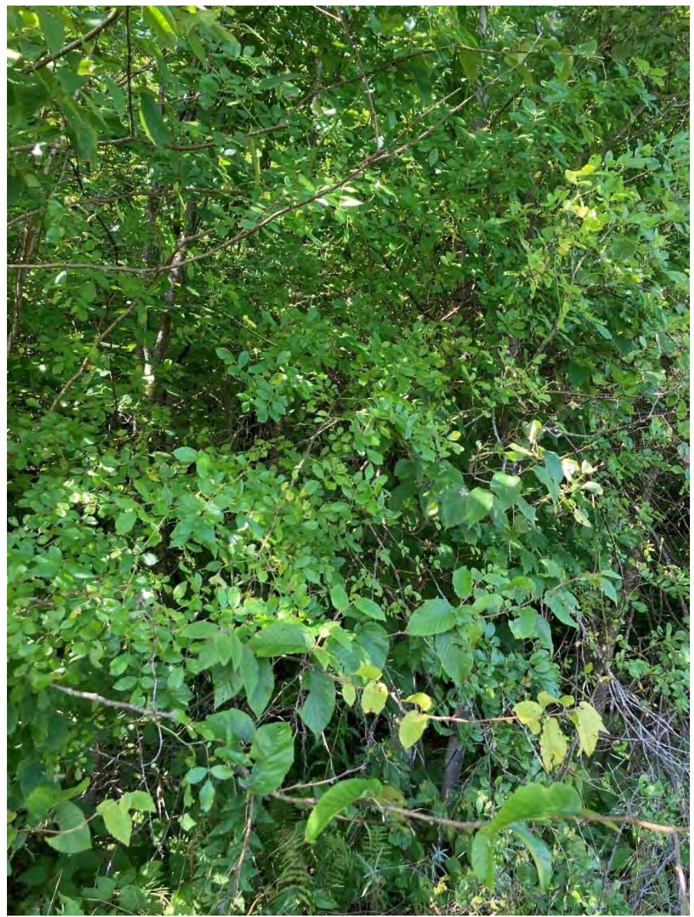
Photo 5.13 Multiflora Rose ( Rosa multiflora ), an invasive vascular plant detected within the Study Area.

Multiflora Rose is widespread within Nova Scotia where it is difficult to eradicate and considered a serious threat to native habitats (Munro et al., 2014). A small specimen was identified at a single location, at the edge of a wooded area. This location is depicted on Figure 5-1 through Figure 5-4.