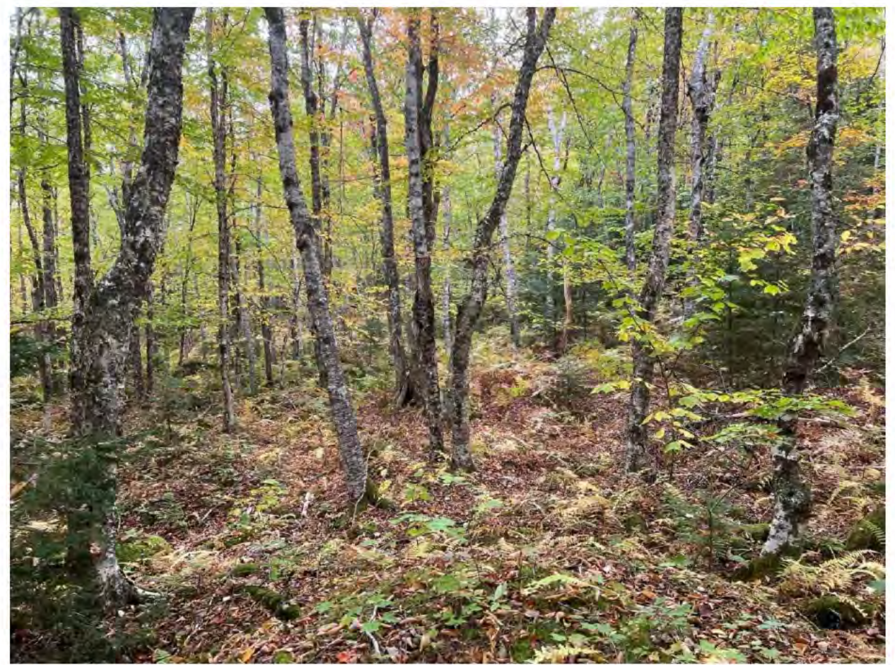
Photo 5.24 Example of TH7 - Yellow Birch - White Birch / Evergreen Wood Fern VT.