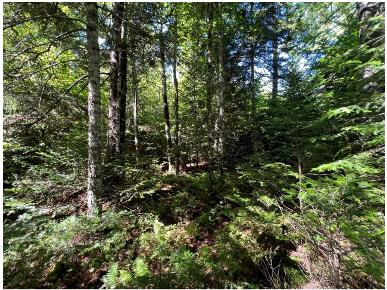
Photo 5.16 Example of MW1 - Red Spruce - Yellow Birch / Evergreen Wood Fern VT.