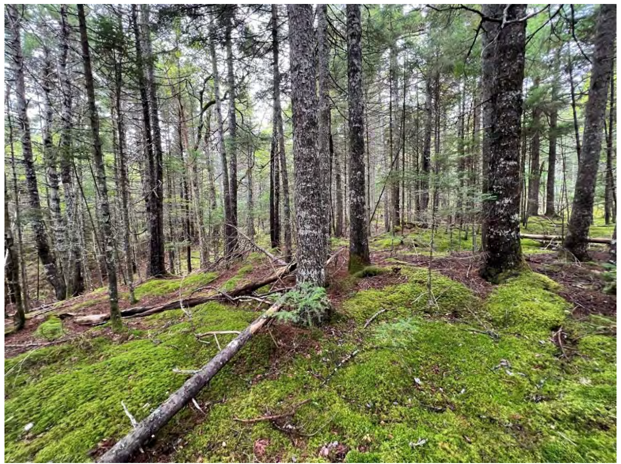
Photo 5.23 Example SH6 Red Spruce - Balsam Fir / Stair-step Moss - Sphagnum VT.

Three-Seeded Sedge ( Carex trisperma ) will be present. The bryophyte layer is characterized by extensive coverage of mainly Stair-step Moss and Schreber's moss, with Sphagnum mosses present in wetter parts of the stand.