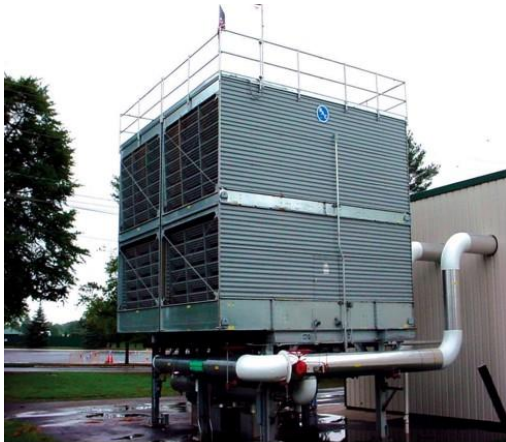
Figure 1-2: Cooling Tower System

A typical cooling tower system is shown in Figure 1-2, below.