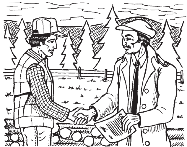
Signing a contract is smart business for both the landowner and the contractor.

Besides having a contract, walk the woodlot with the contractor so that you both understand what is to take place, how much wood is to be harvested, and what trees are to be left uncut.