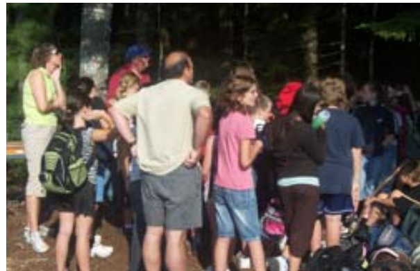
Photo: Children appreciated the Veinotte's Woodlot. Taken by Simon Mutabazi during field day on September 27, 2007.

Like the two regional winners, two days were allocated for WOYA field events at the Veinotte's place. On September 27, 2007, more than two hundred and seventy (270) school children visited the majestic property of the Veinottes and were educated by DNR officials. Children were exposed to activities such as integrated resource management, wildlife habitat, silvicultural treatments, minerals, law enforcement, and much more. The tour provided opportunities for children to appreciate the beauty and reconnect with mother nature, and also a unique opportunity to learn about career options within the realm of natural resource management.