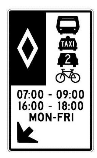
RB-81A 90 x 150 cm