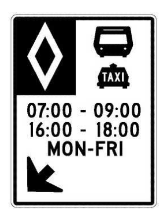
RB-81 90 x 120 cm