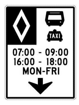
RB-80 90 x 120 cm