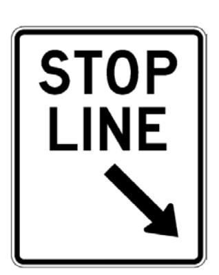
RC-4R 60 x 75 cm