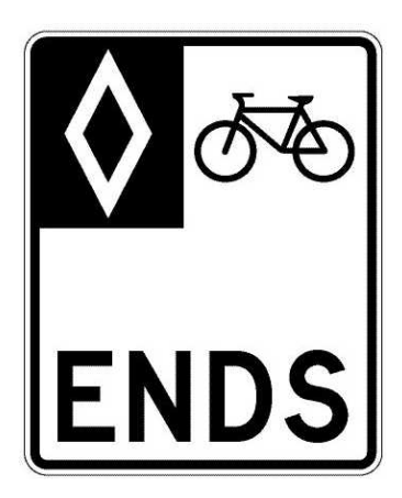
RB-92 60 X 75 cm