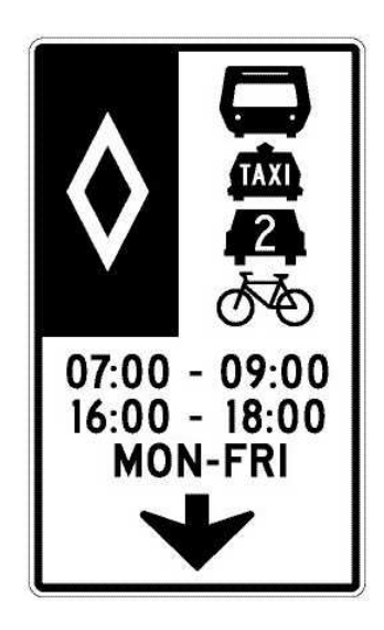
RB-80A 90 x 150 cm