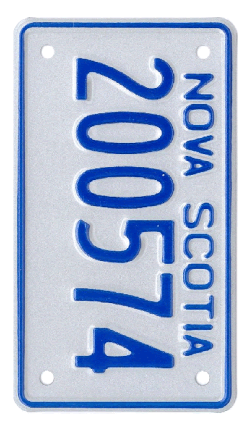
Appendix A Depiction of Motorcycle Number Plate