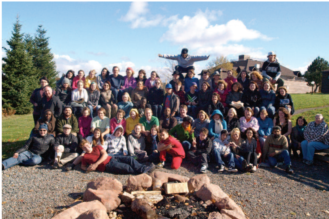
Leaders of Today Annual Youth Summit, Tim Horton Children's Camp, Tatamagouche, Nova Scotia

The Strategy is also supported by a network of youth and youth agencies called Leaders of Today. This group informs our work, strengthens the youth voice and provides a respectful space for youth and government to learn from one another.